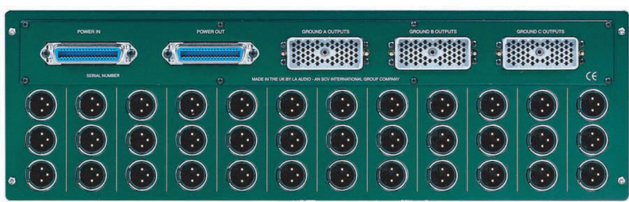
Note: Mutiway audio connectors are no longer available.